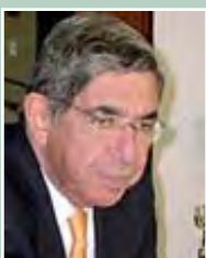
H. E. Oscar Arias Sánchez Chairman 1987 Laureate

Most Reverend Desmond Tutu 1984 Laureate