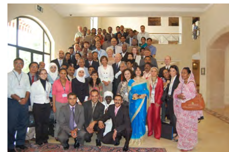
Photo: HRH Princess Basma with participants at the final UPSAM networking conference

Participants representing 16 universities in Bangladesh, Indonesia, India, Sri Lanka, Nepal, Pakistan, Ethiopia, Sudan, Kenya, Somalia, Egypt, Iraq and Jordan as well as UPEACE staff took part in the four-day conference. Also in attendance was HRH Princess Basma of Jordan.