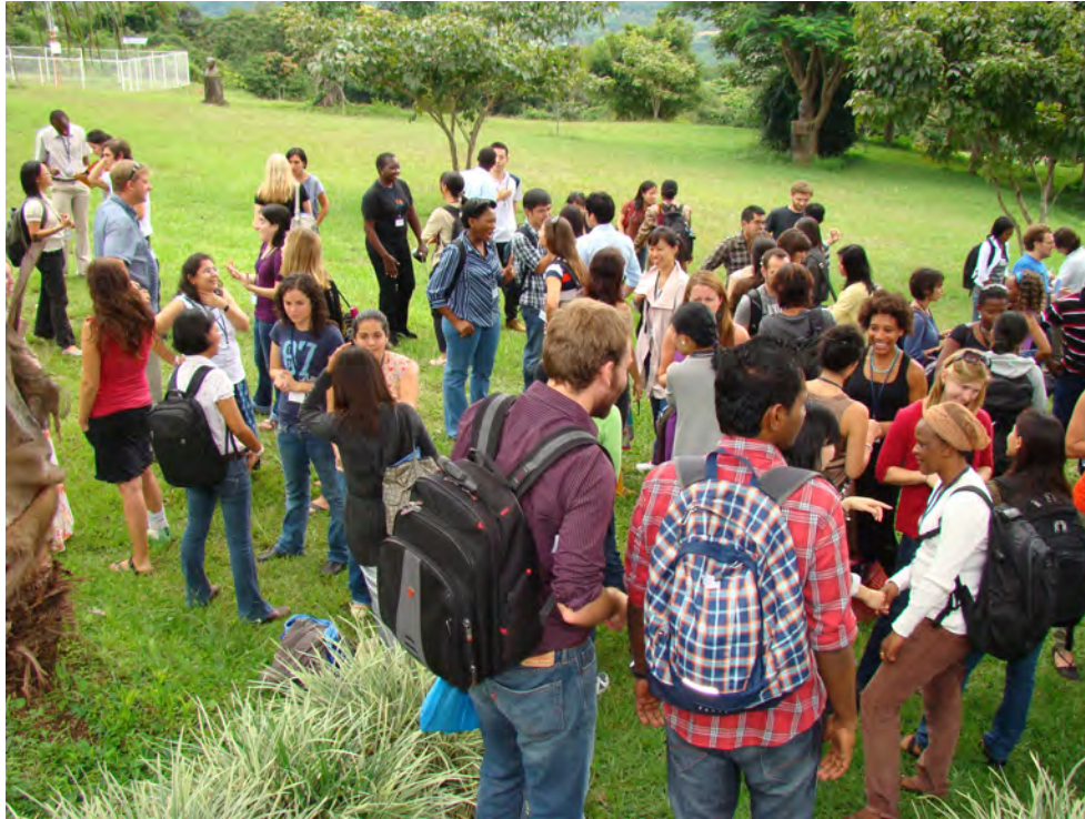
The group consists of 165 students from 52 countries