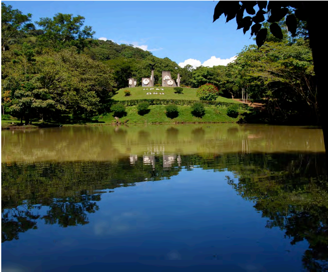
Monument for Work, Peace and Disarmament , located at the UN mandated University for Peace Campus in El Rodeo de Mora, Costa Rica.