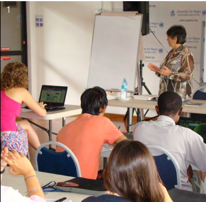
1-2 Hon. Ruth Dreifuss shared with UPEACE students on a Conference at UPEACE campus. 3. Chancellor Dreifuss lectured MBA students at INCAE Business School.

with UPEACE and other research and teaching organizations based in Costa Rica, such as EARTH University (School for Agriculture in the Humid Tropical Region) and INCAE. These four organizations, CATIE, UPEACE, EARTH and INCAE, along with other individuals, are working to establish a consortium to present Costa Rica as a world-class destination for knowledge, science, technology, and innovation.