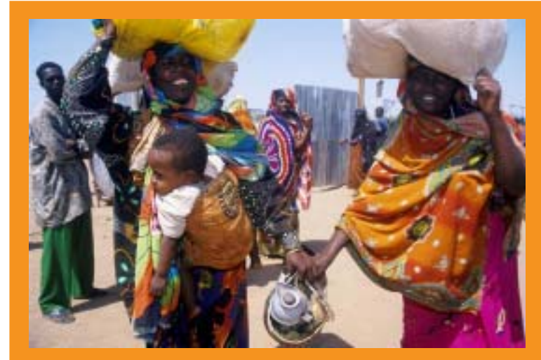
UNHCR / B. Press